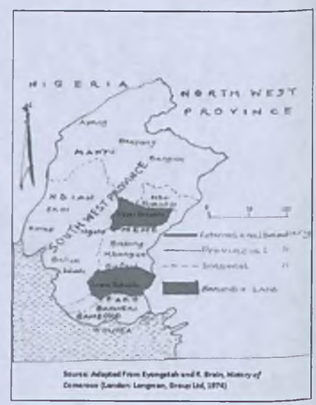
Maps showing the position of Bakundu in Cameroon (A) and south west region (B)

Bakundu people. This is due to the fact that the Mungo River has its outlet east of Victoria (Limbe) and forms part of the Anglo-French boundary, while the River Meme has its outlet in the creeks of the Rio del Rey area, influencing exchanges with people from other areas. An example is the River Mungo, which was used by the villagers of Banga, Bombe, as well as Ndifo to trade with the Douala natives. Furthermore, most of the European factories during the colonial period were stationed on the banks of these rivers. The Bakundu people and neighbouring clans brought their produce and sold them to the German factories which played a large role in their economic life and living standards.